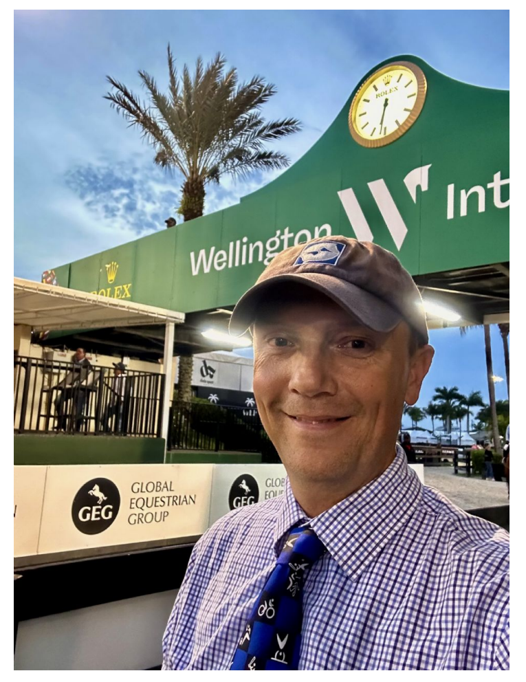
Palm Beach Equine Clinic is the official treating veterinarian for the Winter Equestrian Festival. ↑ Congratulations to Team Ireland ■ Team Canada ➡ and Team USA ■ who prevailed as the Top 3 finishers in the Nations Cup! ◆

and conducting the horse inspection, aka "The Jog," which checks that the horses are fit to compete. She is then ring-side and in the stables ensuring the overall health and welfare of all horses competing.